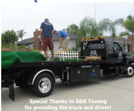
Special Thanks to S&R Towing for providing the truck and driver!

Oceanside's Independence Day parade was the first one for Friends of El Corazon. Volunteers had a great time turning the empty truck donated by S & R Towing into a full fledged float with soccer kids, bubble blowing, bird watching, trees, flowers and a great preview of our park. Thanks to: Oceanside Soccer Club for marching with us and showing how much the kids of Oceanside are looking forward to our great new park; S and R Towing Company for allowing us use of their flat bed; and to Agri-Services for banners and assistance with float decoration.