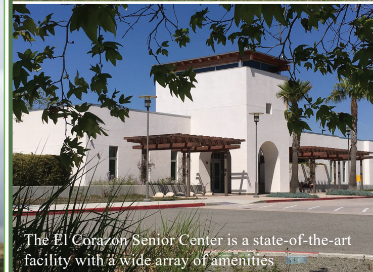
The El Corazon Senior Center is a state-of-the-art facility with a wide array of amenities