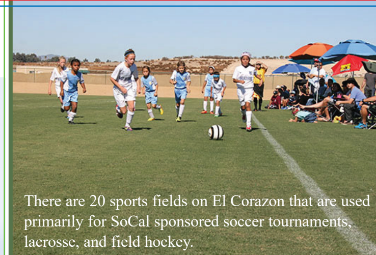
There are 20 sports fields on El Corazon that are used primarily for SoCal sponsored soccer tournaments, lacrosse, and field hockey.